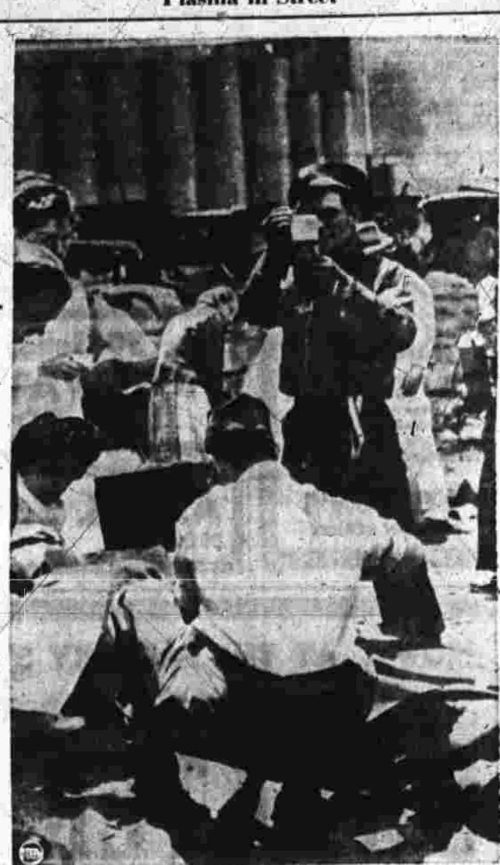
A doctor and a policeman set up a blood plasma station in a shattered street at Texas City, Tex., to treat a victim of the devastating blast that shook the city Wednesday. (NEA telephoto).