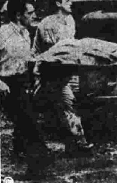
Rescue workers hurriedly remove a stretcher case from the danger zone at Texas City, Tex. Spreading gas fumes added new danger to the exploding oil storage tanks and chemical installations. Estimates of the number of dead continue to rise.

Rescue workers hurriedly remove a stretcher case from the danger zone at Texas City, Tex.