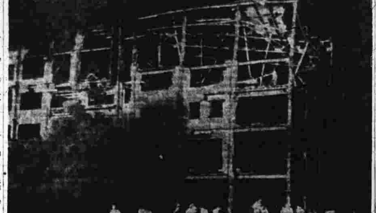
The wrecked building was once part of the $19,600,000 Monsanto Chemical plant at Texas City, Tex. The photo was made during daylight hours but following smoke from the spreading fire obscures the scene. All available fire fighters in the area were called in to battle the flames while rescue workers dug for the bodies of hundreds of dead and injured.